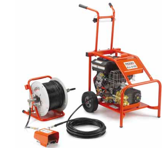
Model KJ-3100 with hose reel removed