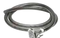
Jet Vac Unit

The Jet Vac attaches to any portable water jetter to quickly remove (vacuum) liquid and debris from flooded basements, sumps, swimming pools, construction sites, car wash pits, etc. This cost and time saving product will move up to 60 gallons of liquid per minute.